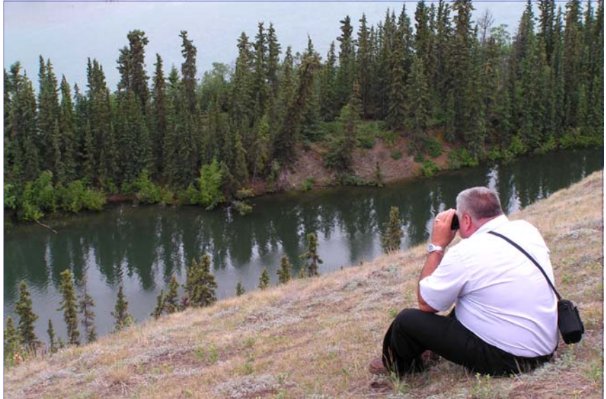
(Above right) Another photo opportunity.