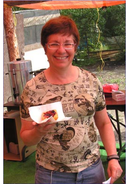
(Above right) There was plenty of hot fresh bannock for everyone at the Lake Labarge Fish Camp.