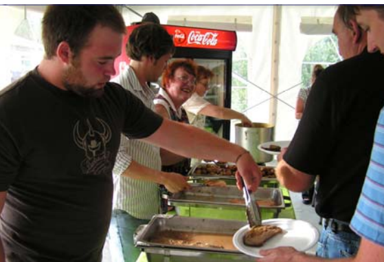
(Middle left) The Yukon Flair Dinner on Saturday night lived up to its name. Guests sampled tasty dishes like wild salmon, squash and whiskey soup, roasted root vegetables, sourdough rolls, cranberry cheesecake and buffalo.