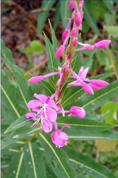
(Above left) Beautiful Yukon fireweed.