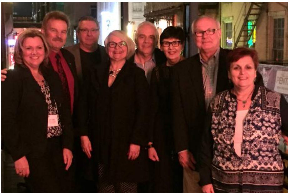
Bottom right: CASSA and AASA colleagues attended a New Orleans Pelicans basketball game together.