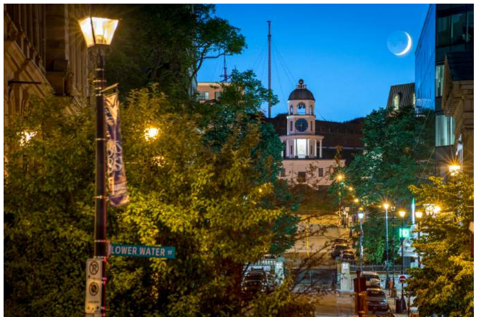
The Halifax Town Clock at night.

when booking or share promo code YHZ01 with your travel agent. Check the CASSA conference website for details on travel and blackout dates.