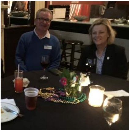
Bottom middle: CASSA belongs to AASA Region 4, and its partners include Illinois, Indiana, Kentucky, Missouri and Ohio.