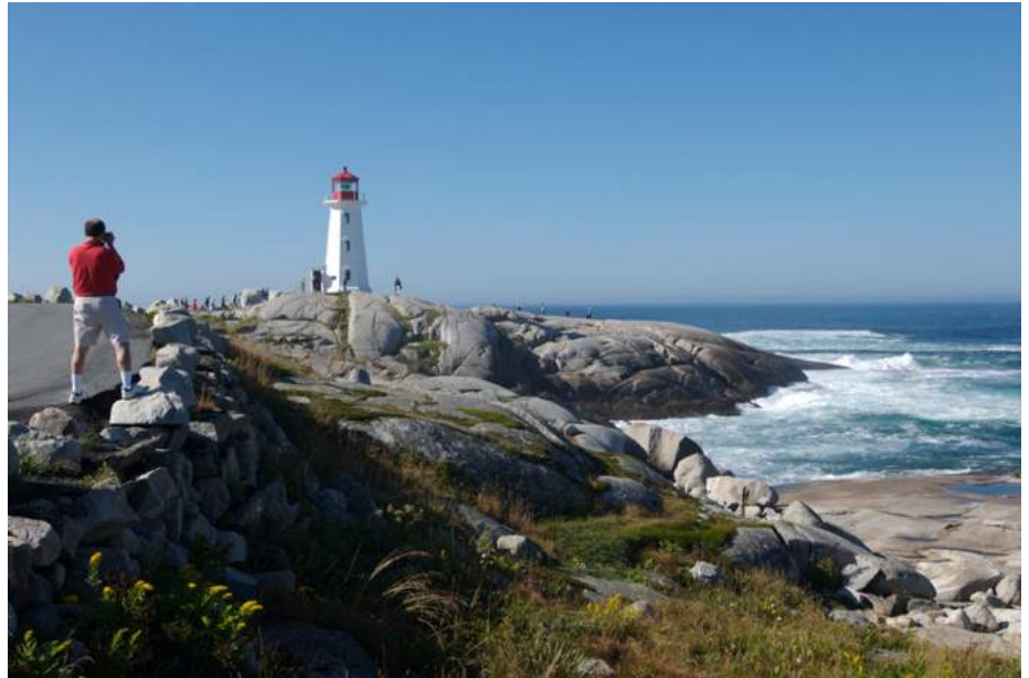
The much-photographed lighthouse at Peggy's Cove.

Your 2017 conference registration fee includes a guided tour of the Canadian Museum of Immigration at Pier 21 on Thursday, July 6, at 2:45pm. The museum is just steps from the host hotel. Discover the museum's exhibition dedicated to the years when Pier 21 was open as an immigration shed. Listen to the personal stories of immigrants from