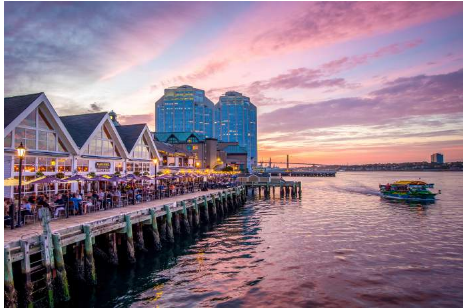
The Harbour Hopper cruising along the Halifax waterfront at dusk.

CASSA delegates are once again being offered a special 10 per cent discount on the base fare for travel between Halifax and anywhere WestJet flies in North America. Be sure to use coupon code NAAOOGG