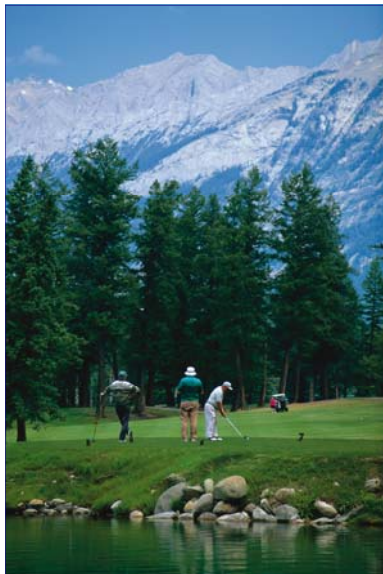
Golfing in the mountains.

Following this sure-to-be inspiring address, join us in the Heritage Ballroom at 8:30pm for a warm Alberta reception sponsored by CASS.