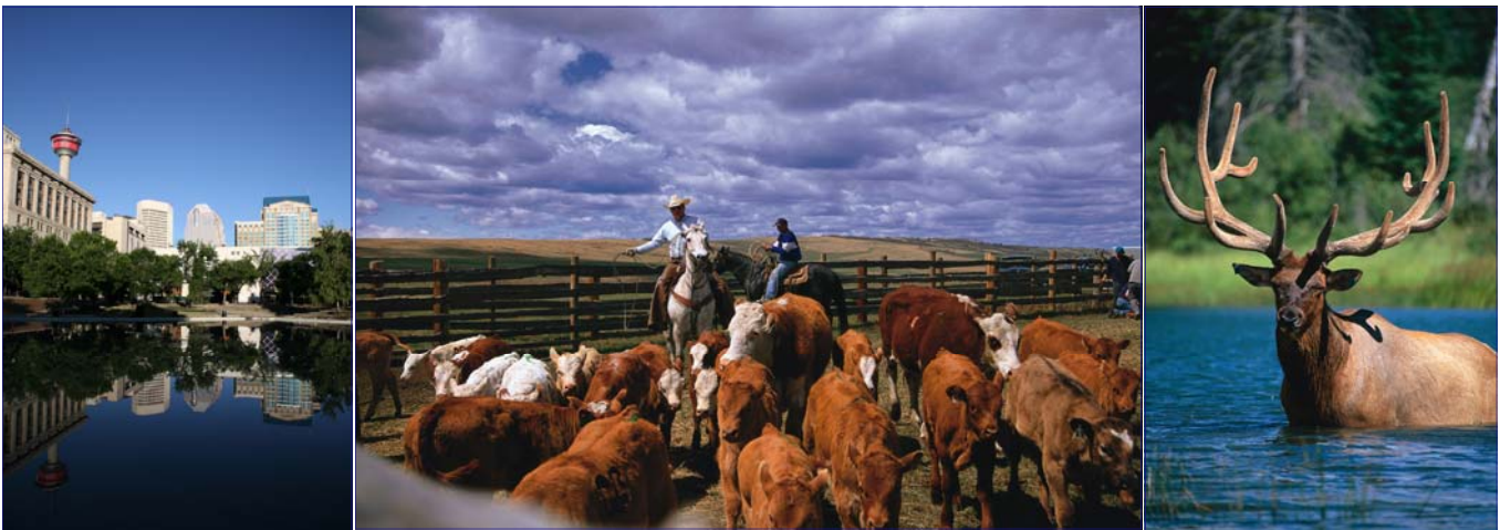
Beautiful downtown Calgary; cattlemen working under a big prairie sky; a majestic elk.

fur-trading era, the 1880s pre-railway settlement and the circa-1910 western town. Catch a ride on the steam locomotive, the SS Moyie sternwheeler or a horse-drawn wagon. At the Calgary Zoo ( www.calgaryzoo.org ), you can see live animals from Africa, Australia, Eurasia, South America or the Canadian wilderness. Dinosaur fans won't want to miss the zoo's own prehistoric park and those with a green thumb will enjoy the zoo's beautiful botanical gardens. The tour costs $75 for adults, $50 for children and includes