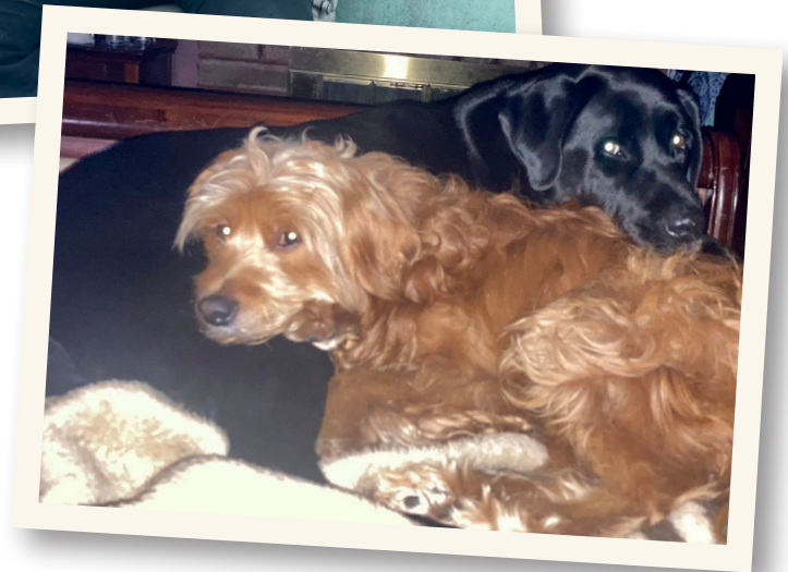
BELOW: Mike's two dogs, Lincoln "Link" (the black lab), and Augustus "Aggie" (the goldendoodle).

then make sure to follow up – that went for staff, students, families, and community."