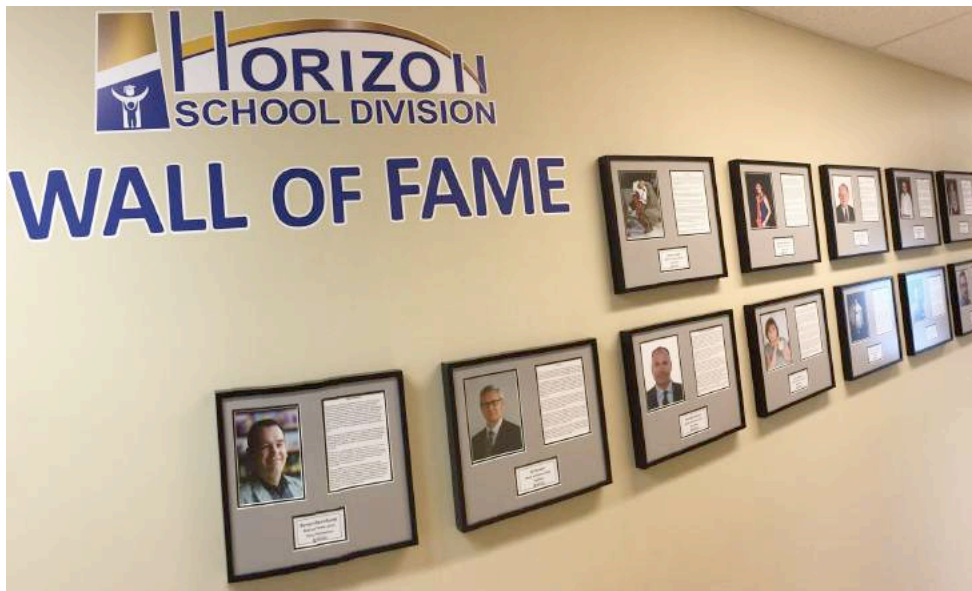
The Horizon School Division Wall of Fame at the division office in Humboldt, Saskatchewan.

Photos for this feature courtesy of the Horizon School Division