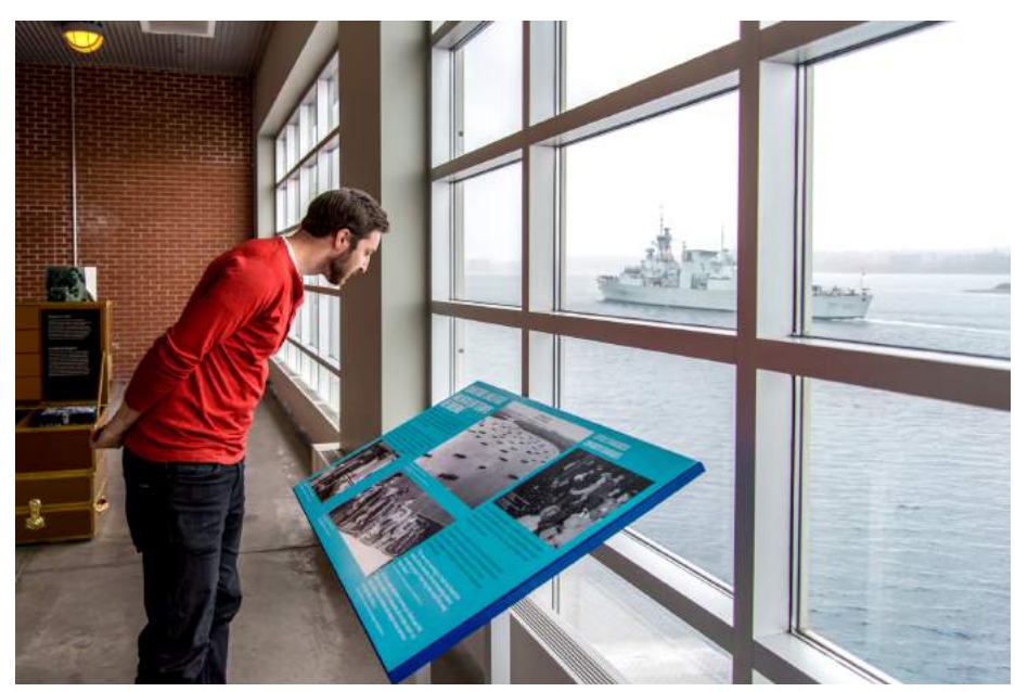
A visitor exploring an exhibit at the Canadian Museum of Immigration at Pier 21.

all over the world in a 20-minute contemporary film. Research your family's immigration history in the Scotiabank Family History Centre and add your immigration story to its growing collection.