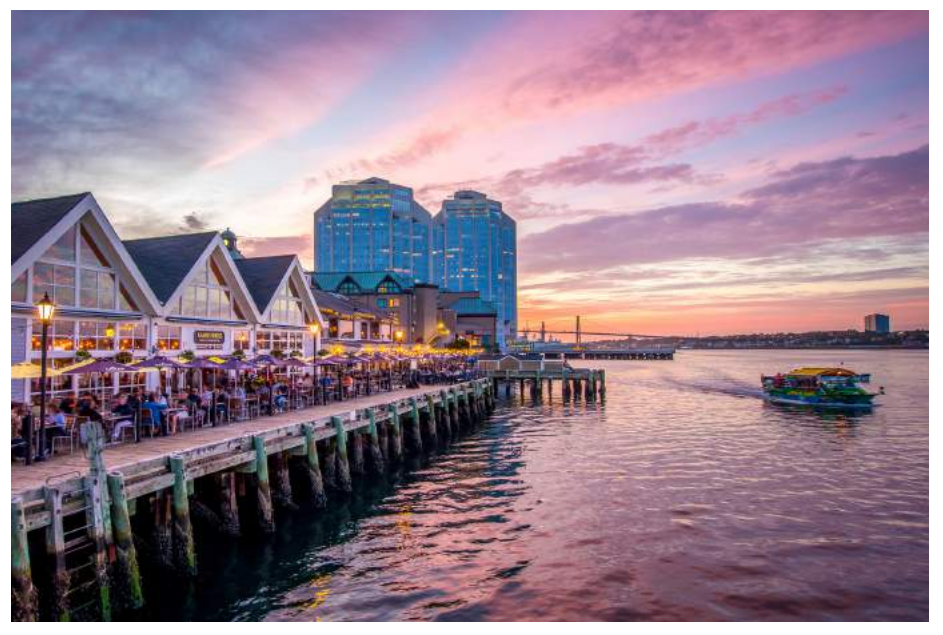
The Harbour Hopper cruising along the Halifax waterfront at dusk.

CASSA delegates are once again being offered a special 10 per cent discount on the base fare for travel between Halifax and anywhere WestJet flies in North America. Be sure to use coupon code NAAAOGG