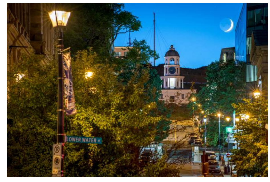
The Halifax Town Clock at night.

when booking or share promo code YHZ01 with your travel agent. Check the CASSA conference website for details on travel and blackout dates.