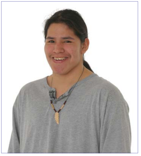
students of First Photo courtesy of Lakehead Public Schools, from Nations, Métis Aboriginal Presence in Our Schools: A Guide for Staff, 2007

One such initiative is Lakehead's voluntary selfidentification policy, where students of First Nations, Métis or Inuit descent