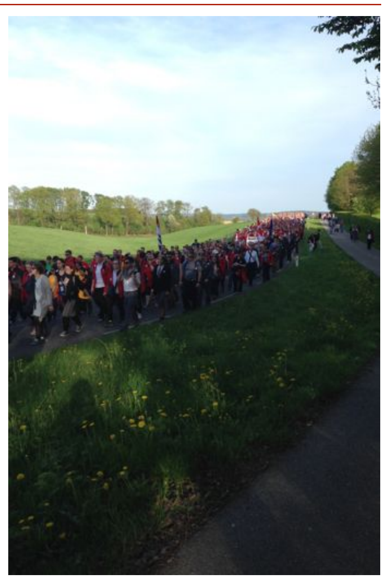
Canadian students walking in the Silent March from Groesbeek Town Hall to the Canadian War Cemetery.

On that day, we witnessed a great party in the streets of Wageningen alongside the 100,000 other revellers. As the