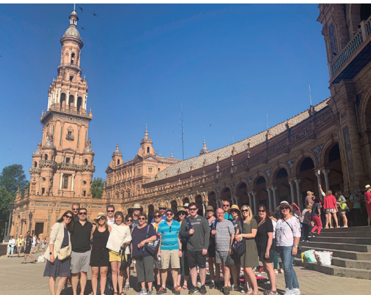
The tour group visited the Plaza de Espana in Seville, Spain. It was built for the Iberian-American Exposition in 1929.