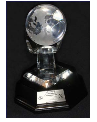
The award, jointly sponsored by Xerox Canada Limited and CASA, has been presented since 2002. It

ASA members who show exemplary leadership ability and who enhance school administration are eligible for the EXL Award.