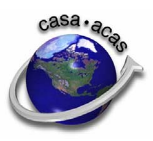
February 2007 Volume 3, Issue 16