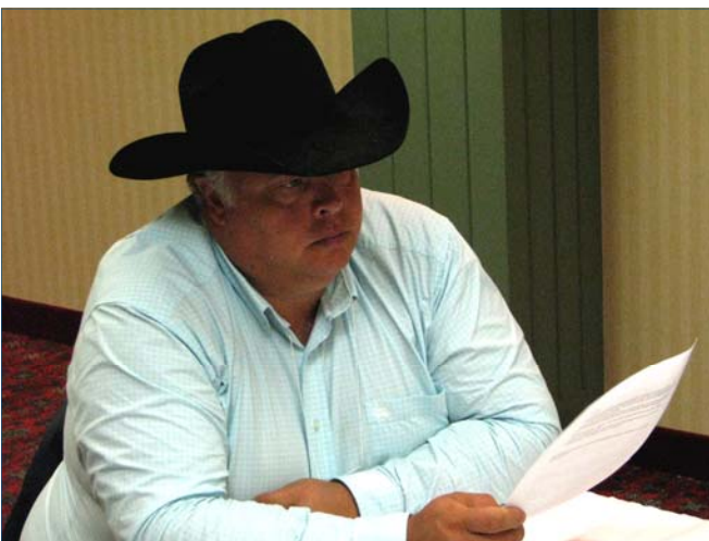
At the Calgary conference in 2009.