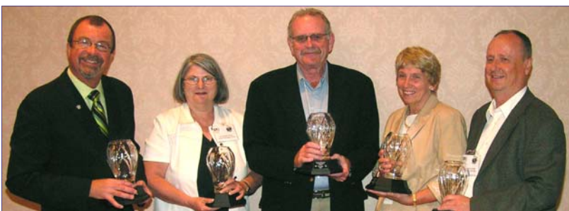
Nominees for the 2008 EXL Award, presented in Halifax, Nova Scotia.

Nominations for the EXL Award are accepted between October 1 and May 16; nominations received after May 16 will be considered only by consent of the executive council.